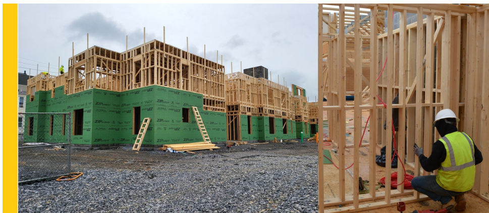
CITRUS GROVE SENIOR LIVING PROJECT UPDATE